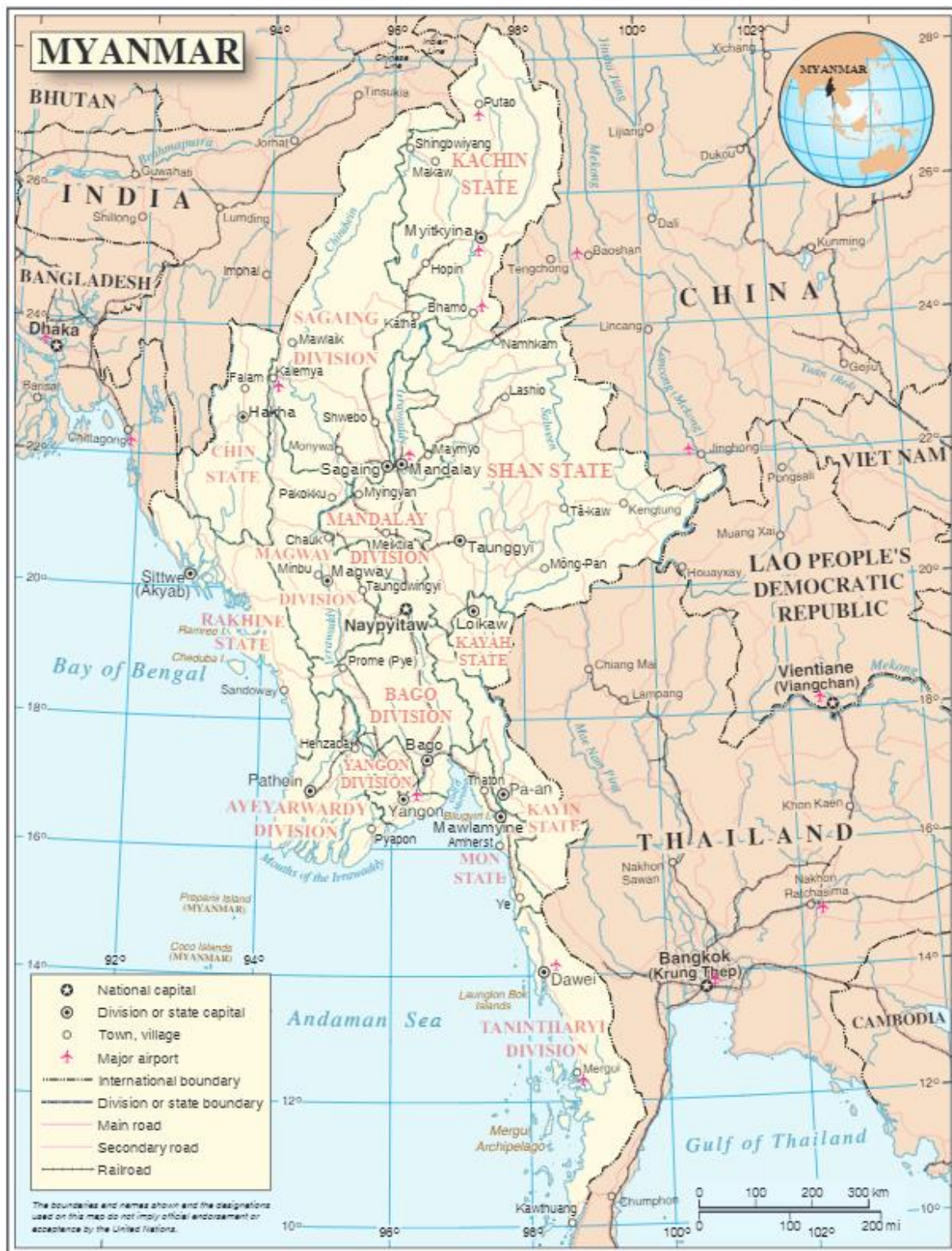
Map of Myanmar 39