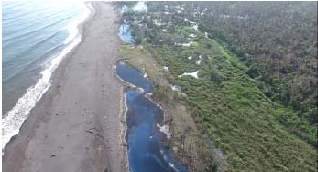
Figure 41: Report of the Court-appointed experts, CRNIC-CRNIP 2017/18, p. 35.

Turning to the question of whether there is a water channel connecting the river and Harbor Head Lagoon, I differ with my learned colleagues in drawing firm conclusions from the existence of “elongated . . . coast-parallel lagoons.”